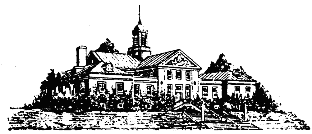
CITY HALL City of Ellsworth